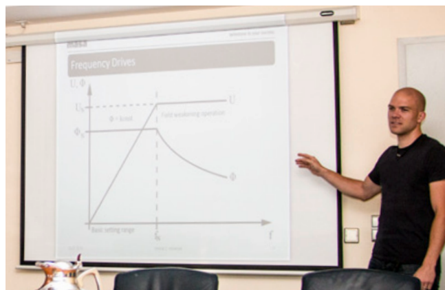
Technical contexts - clearly explained