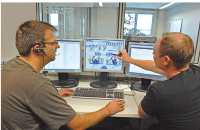
Specialists in our remote service department

Masa F-E-S Support Center Phone: +49 2632 92 92 88 E-mail: hotline@masa-group.com