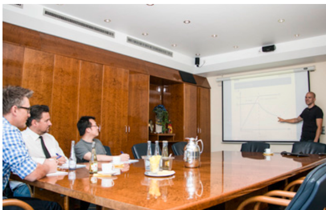
Masa in-house training