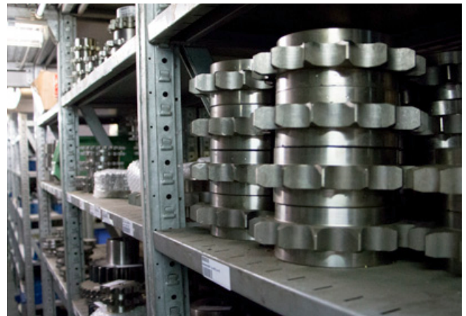
Targeted spare parts storage results in short delivery times