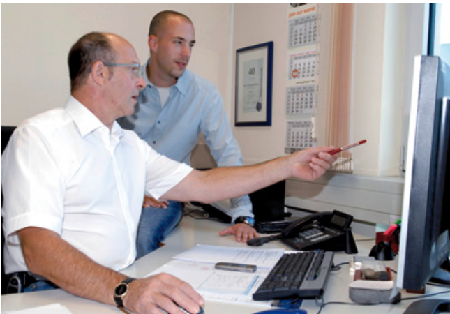
Experience pays off: Our staffers competently and reliably advise our clients

Our team members can be contacted by telephone, fax, e-mail or with a specific spare parts inquiry via our home page.